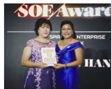
Spirit of Enterprise Award in 2018.