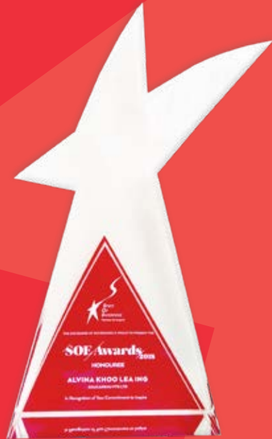
Spirit of Enterprise Award (SOE) - 2018