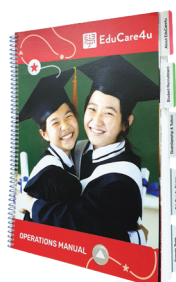
The above is the photo of the Operations Manual.

As you start this exciting journey of working with us, we are committed to growing our partnership with you by providing ongoing support in the form of ongoing training, improvements and updates to the business operations, and business reviews.